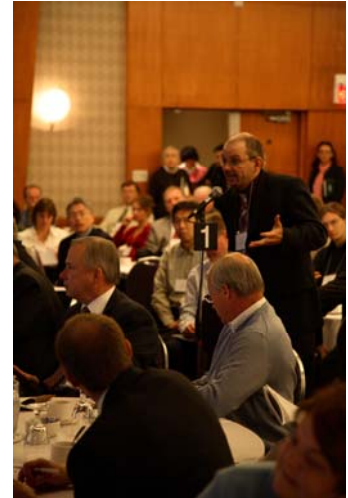
Questions from the delegation