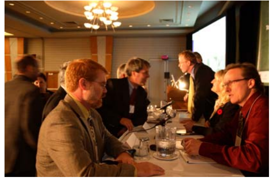
Delegates and panelists interacting after a session